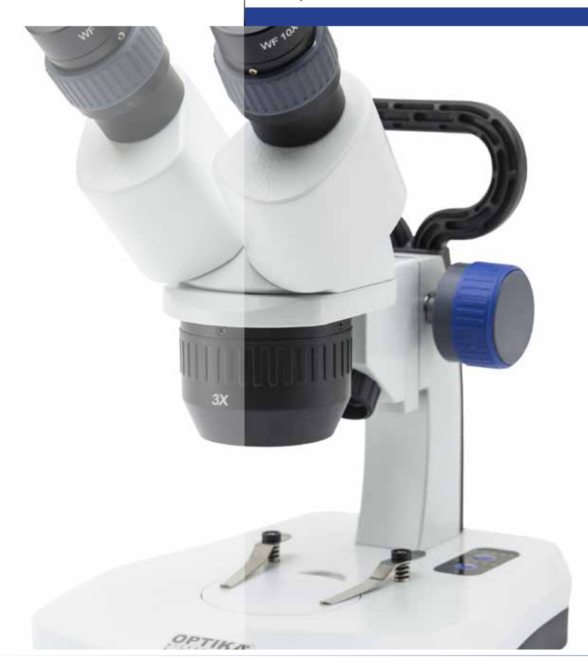
Entry-Level Monoscopes & Stereomicroscopes For Students